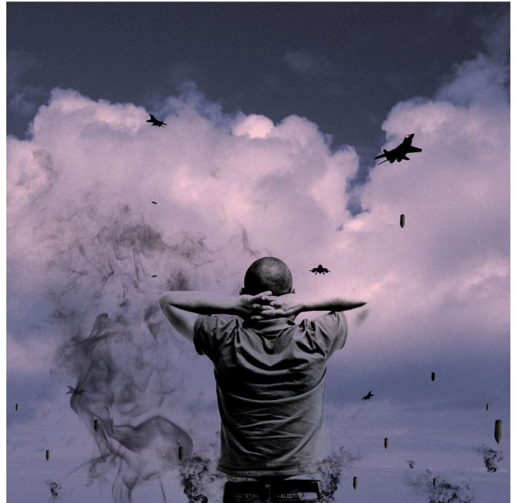
Tammam Azzam (Syria), I, The Syrian , 2012.

FotoFest is sponsoring a day-long conference on Arab Art, Saturday, March 29, 2014 at the Museum of Fine Arts, Houston (MFAH) . This conference features lectures and roundtables with leading curators, participating Arab artists, and